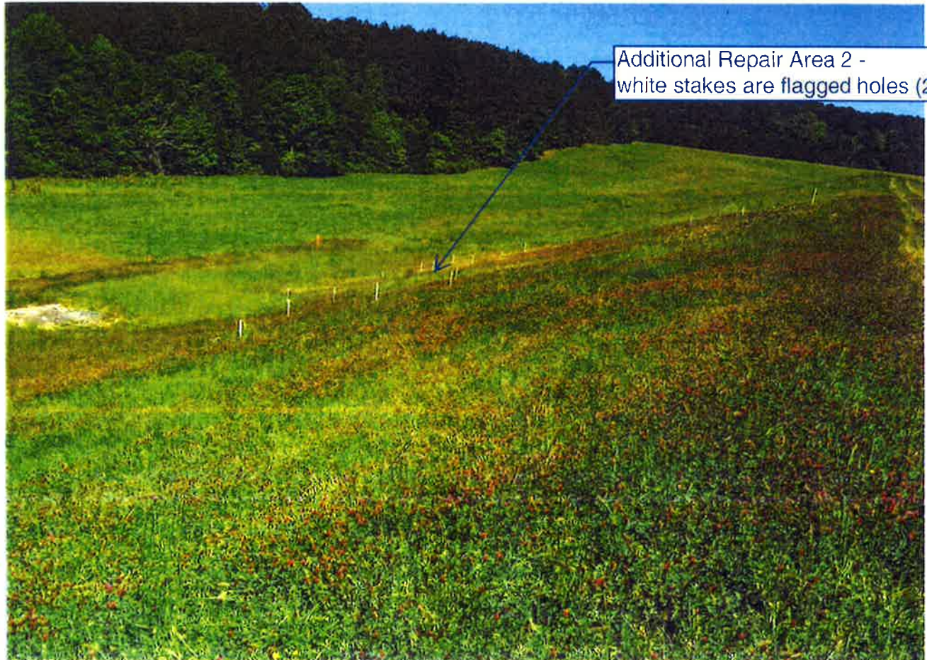
Additional Repair Area 2 - white stakes are flagged holes (21)